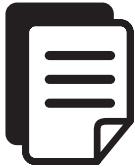
Any legal custody documents