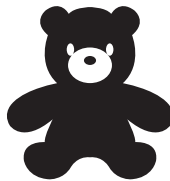
Your child's favourite toy