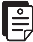
Any other health insurance information