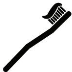
Toothbrush and toothpaste