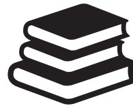
Activities, books, or school work