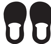
Non-slip slippers or shoes